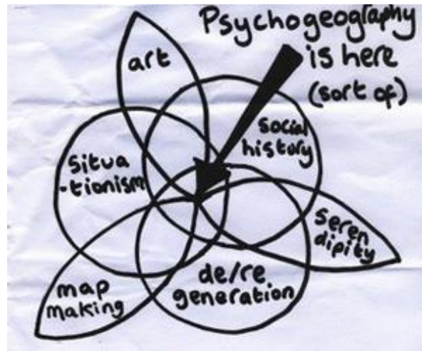
Figure 1: Schematic diagram – Explaining complexity of Psychogeography.

Despite the efforts put in by psychogeographers, the theory of psychogeography goes almost un-noticed, when tackling the upcoming issues in the field of urban design. The term, psychogeography till present has been used more as a documenting tool than a designing tool. The initiatives under the named theory have always been a critic of existing cities and scenarios. Right from the Situationists Internationale (Wikipedia, n.d.), started by Guy Debord , who initiated the notion of psychogeography, to authors like Kevin Lynch and Jane Jacobs in their books, have analyzed or documented an existing city based on the aspects of the theory discussed.